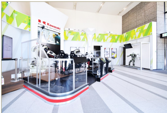
Newly re-opened Kawasaki Robostage

Kaleido is 178cm tall and weighs 85kg, just like the size of an adult human. Come and meet him at Kawasaki Robostage to experience the future where robots and humans co-exist. You can feel that the future is just around the corner!